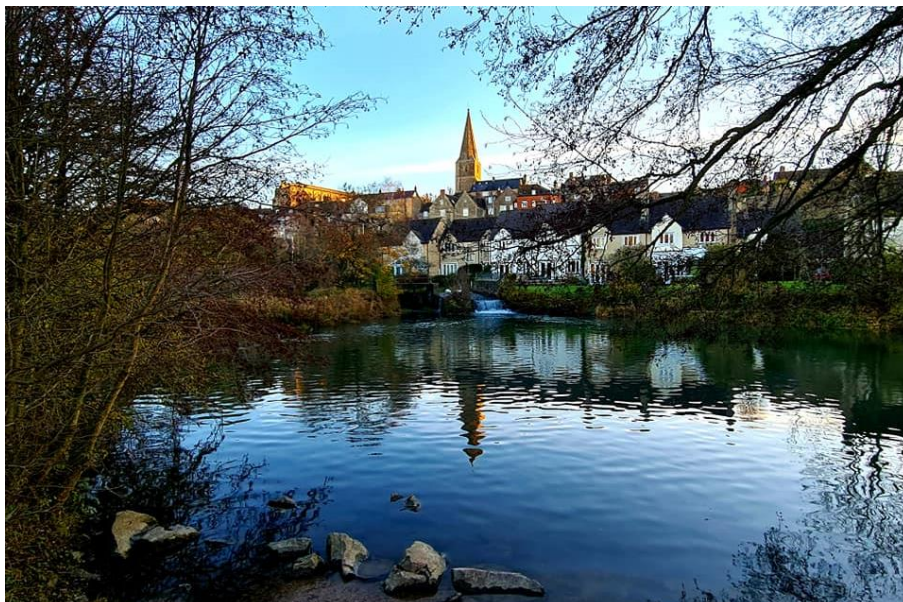
View of the town from Daniel's Well, currently outside the Malmesbury Town Council boundary.

litter collection and co-ordination with landowners - should be led by the Town Council but are currently within the curtilage of St Paul Malmesbury Without parish.